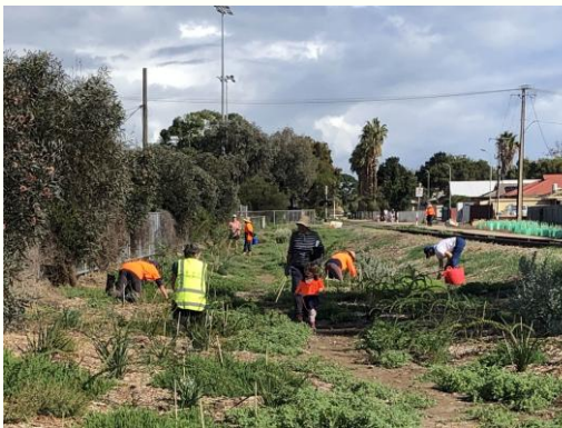
along Hardy St

During the past two months there has been plenty of activity along the Loop, including considerable weeding and mulch-shifting.