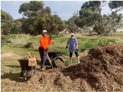
at the Gillman Marshalling Yards

In May we also held our inaugural 'wheelbarrow run' ...several GRL members met at the Russell Street end of the Loop and wheeled our way along to Newcastle Street collecting assorted glass, plastic, wire and other rubbish. We have also been removing the tree guards where the plants are outgrowing them.