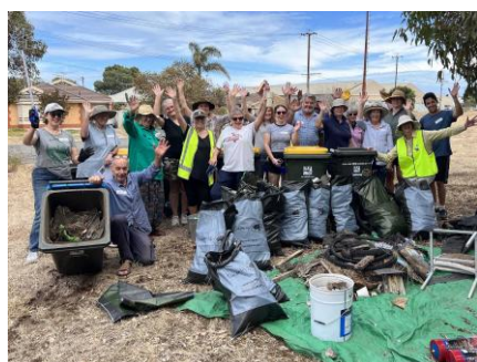
Clean Up Australia Day event at the Gillman Marshalling yards, 1 March