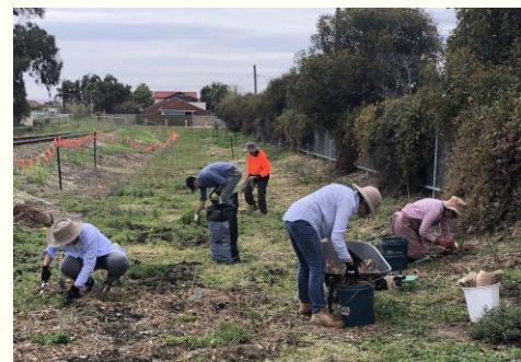
more weeding and mulching