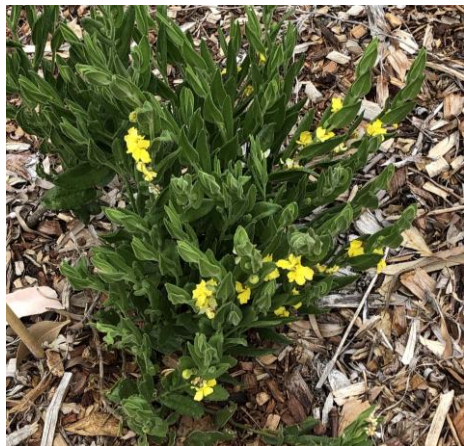
Goodenia Amplexans – Clasping Goodenia many plants are now happily flowering