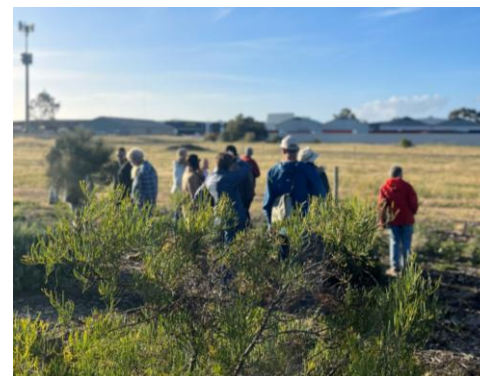
Community members taking a walk around the community plantings in the Gillman Marshalling yards

Local residents have been taking regular walks along the Loop, getting to know the area and imagining future possibilities