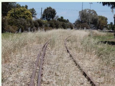
old railway lines overgrown with weeds