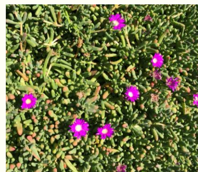
'Karkalla' - Carpobrotus rossii in flower

During 2025 more than 90 community members have helped with on-ground work to establish more than 1400 local native plants along the southern part of the Loop.