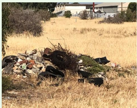
dumped rubbish accumulated over many years