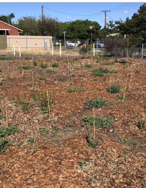
the plantings are growing well along Hardy Street (November)