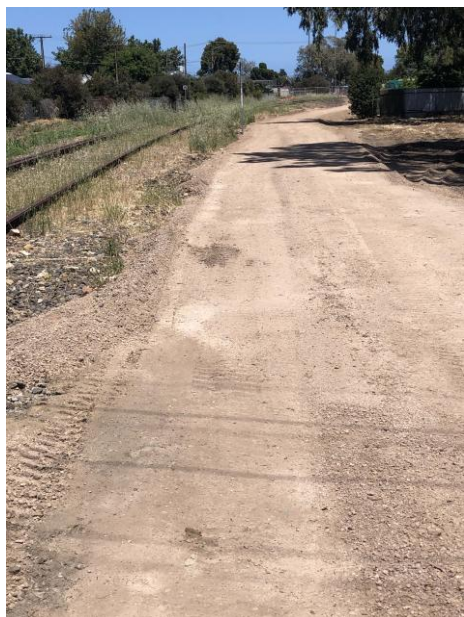
the new path is taking shape

Work on the Loop will pause 15/12/2025 and recommence mid-January.