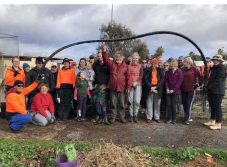
planting on Newcastle Street in July