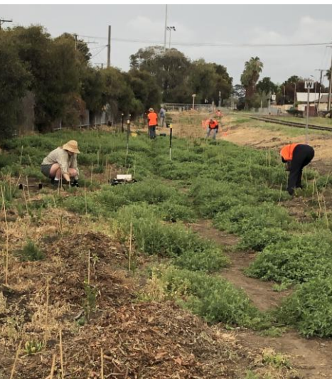
community members tackling the weeds