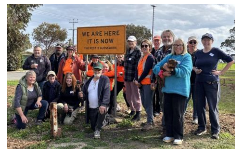
The GRL crew at the Gillman Marshalling Yards on 9 August