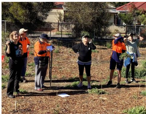
Community members participating in the Great Aussie Bird Count along the Loop