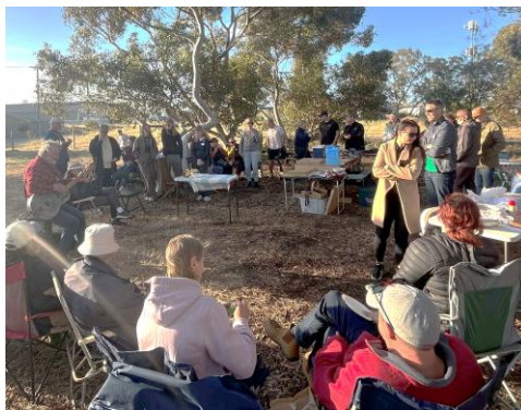
our community gathering on 30 November

Thank you ....to all the individuals, community groups and organisations who have supported and worked with Greening Rosewater Loop this year including: