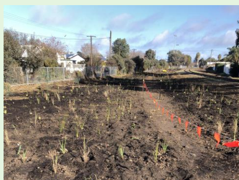
Hardy Street after the first planting