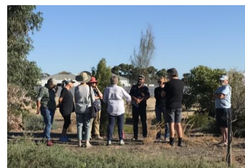
GRL welcomed PoANT Tree Group to the Loop for a site visit on 13 March 2025

Community members from Rosewater, Gillman, Ottoway and the wider Port Adelaide area have come together along the Loop during the year.