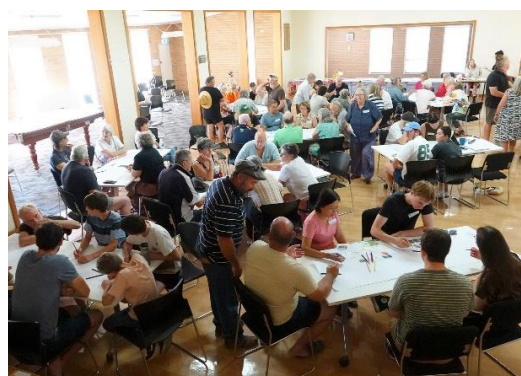
Community members sharing ideas at the Ottoway Hall in January 2025

Imagine ...a cooler, greener Rosewater, Ottoway & Gillman