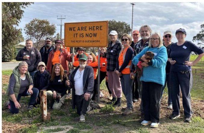
The GRL crew at the marshalling yards on 9 August